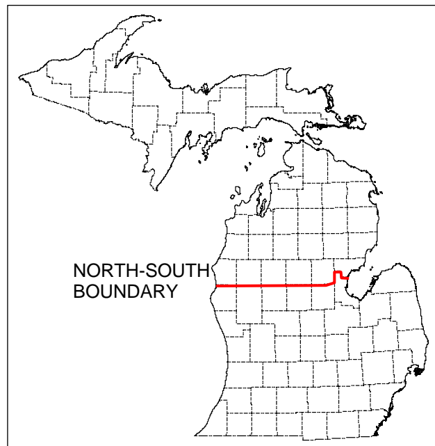
Figure 1. Map showing the boundary used to separate southern and northern Michigan marsh bird surveys.

and June 1-15. Northern Michigan surveys began later and occurred during May 15-31, June 1-14, and June 15-30. Marsh birds were surveyed during the morning (0.5 hr before to three hr after sunrise) or evening (two hr before to 0.5 hr after sunset). We conducted 10-min point counts consisting of a five-min passive period followed by one-min broadcast periods for primary target species. At southern Michigan sites, we broadcasted calls of American Bittern ( Botaurus lentiginosus ), Least Bittern ( Ixobrychus exilis ), King Rail ( Rallus elegans ), Virginia Rail ( Rallus limicola ), and Sora ( Porzana carolina ). Calls of American Bittern, Least Bittern, Yellow Rail ( Coturnicops noveboracensis ), Virginia Rail, and Sora were broadcasted at northern Michigan points. We recorded the minute during which individual birds were detected and estimated the distance to each marsh bird when first observed.